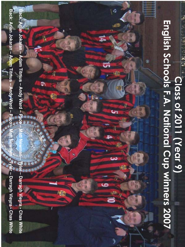
Class of 2011 (Year 9) English Schools F.A. National Cup winners 2007